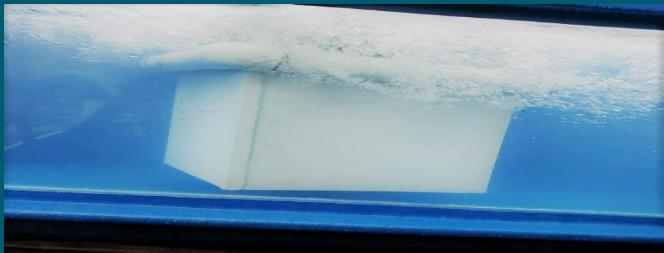
Picture: Demo aerator

This process accelerates the digestion of heavy sludge deposits that are sitting dormant on the bottom of the tank. The quad flow aerators are designed to deliver a unique combination of coarse, medium, and fine bubbles which when released at a specific depth, draws the water in through the bottom of the unit creating a true venturi. Water is pulled upward and O 3 injected on all sides being redirected into a flow across the highly oxygenated upper portion of the water column.