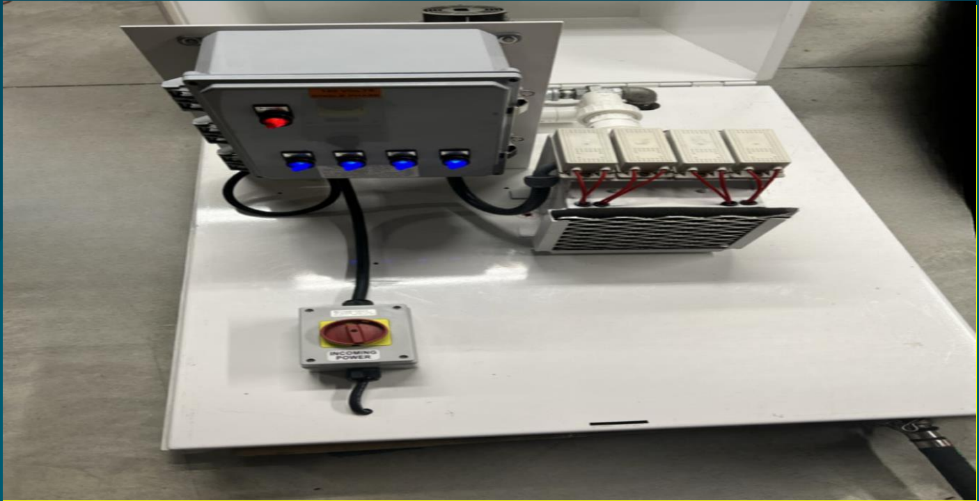
Picture: Demo Blower and O3 manifold for industrial water

The Patent Pending High Volume Quad Flow Aerator / Mixers are high efficiency all welded, heavy duty aluminum or stainless-steel devices. These state-of-the-art quad flow aerators are designed to pull water from the bottom of a produced water tank and or pond/basin for treatment. By injecting them with heavy concentrations of dissolved oxygen and adding high strength ozone directly into water column. By operating with low-pressure (>2.5 P.S.I.) high-volume ambient airflow, these devices maximize oxygen transfer and energy efficiency. These units are scalable, multi voltage and can be modified to fit any industrial water application.